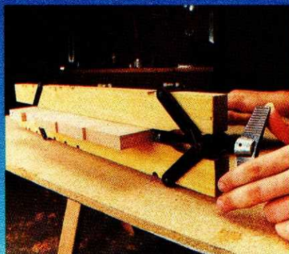
The Double Bar Clamp is ideal for clamping stock edge to edge for table tops.

They're sure to be popular —so order yours today!