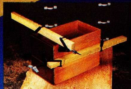
Use the Double Bar Clamp as a single action bar clamp.